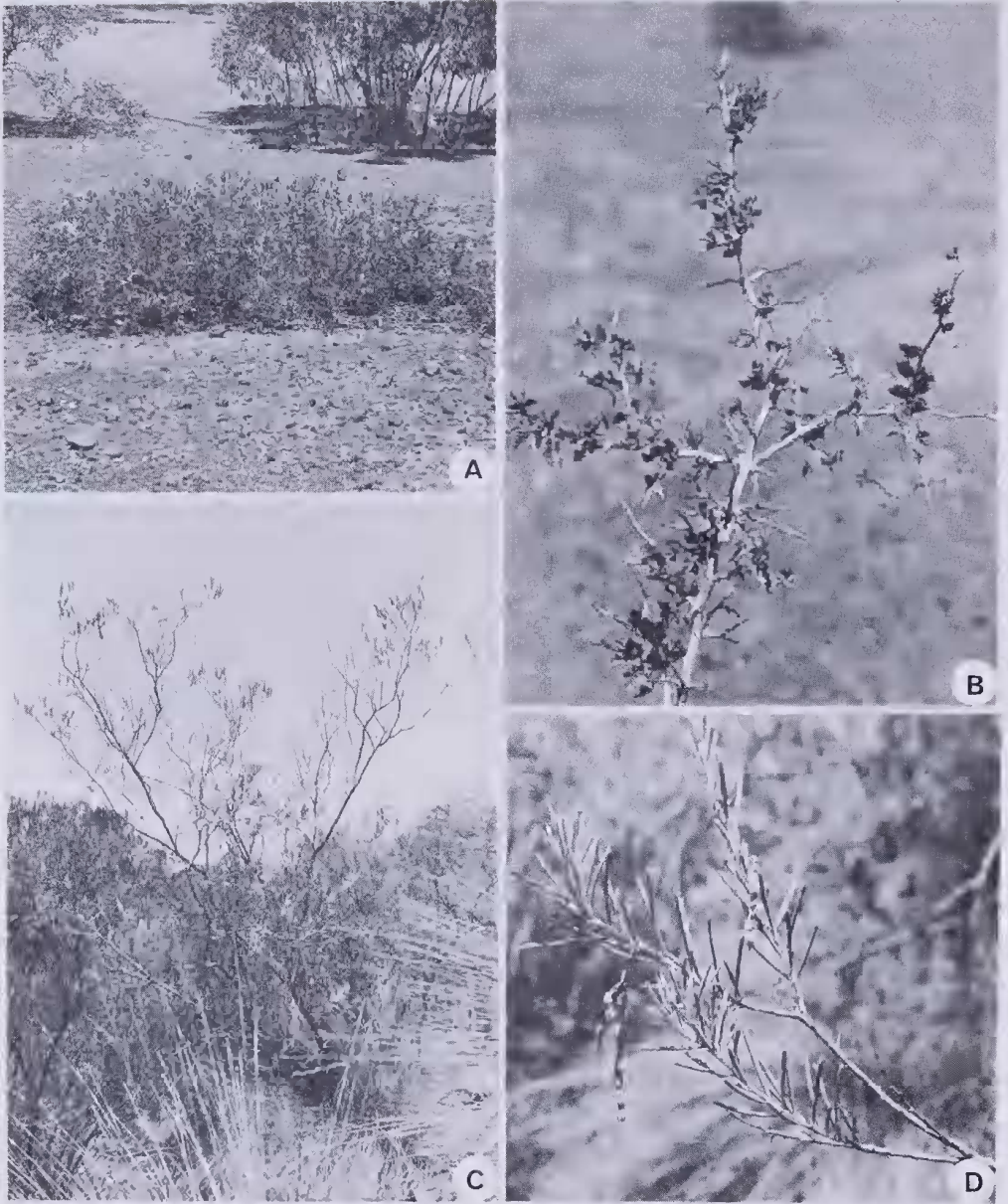
Figure 3. A and B: A. botrydion (A—habit; B—branch showing short, divaricate, spinescent branchlets). C and D: A. pharangites . All photographed in situ in the Wongan Hills.

Wiry, open, diffuse shrubs to c. 1 m tall, often with sprawling prostrate branches. Branches \pm straight, terete, finely nerved, reddish brown to light brown, slightly shiny, sometimes sparsely verruculose, glabrous or sparsely hispidulous, terminally coarsely pungent but lacking the short divaricate \pm spinescent branchlets of A. botrydion . Phyllodes asymmetrically oblong-elliptic, 10-20 mm long, 5-9 mm wide, length to width ratio 1.5-3, slightly to obviously undulate, ascending at c. 45° from the branch, glabrous to hispidulous, light olive green to subglaucous, margins